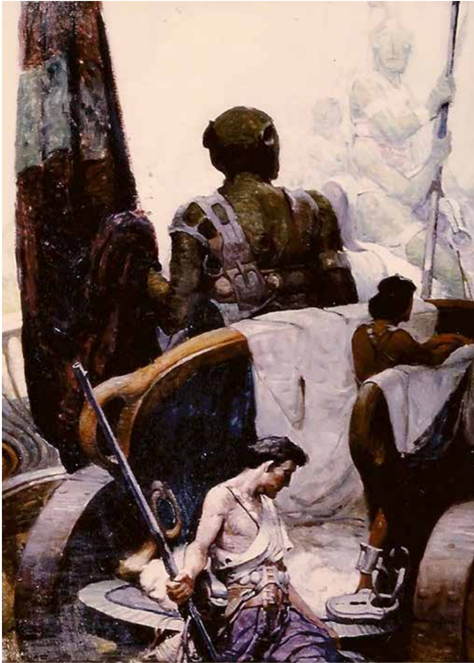
I sought out Dejah Thoris in the throng of departing chariots. (See Page 91)